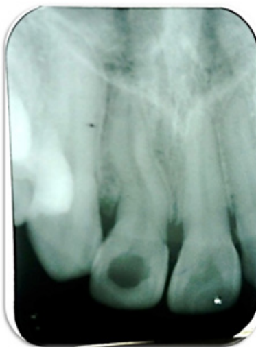
Figure 1: Flexion of root in relation to 11.