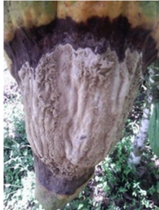
Figure 5: Sporulation stage of the pod two weeks after the beginning the sporulation process. Granja La Nacional, Támara municipality, Colombia SA.