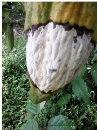
Figure 2: Pod of the clone ICS-39, seven days after that was observed in brown stain state. Granja La Nacional, Támesis municipality, Colombia SA.

Seven days after the beginning of the monitoring process (July 22 nd ) the pod was found sporulated (Figure 2). The white pseudostrome covered all the stain and the formation of cream-colored spore lumps was observed in different places. It was from this moment on, that the diseased pod became a powerful source of infection