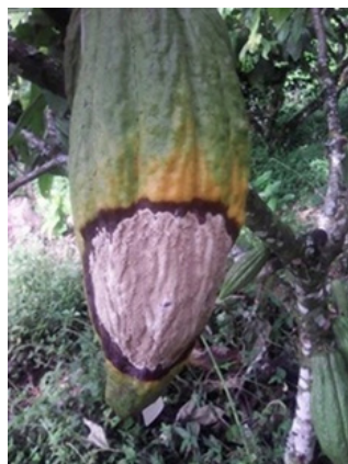
Figure 3: Sporulated pod eleven days after its original brown stain stage. Granja La Nacional, Támesis municipality, Colombia SA.