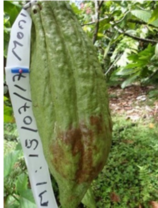
Figure 1: Pod with M. roreri in brown stain stage (clone ICS-39). Granja La Nacional, Támesis municipality, Colombia SA.