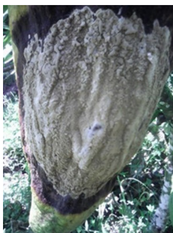
Figure 4: Sporulation of the pod one week after the beginning of the sporulation process. Granja La Nacional, Támesis municipality, Colombia SA.

On August 5 th , two weeks after the beginning the sporulation process, the pod is still intact with spreading cream-colored spore lumps; similarly to the previous week Figure 5. This means after beginning the sporulation process and during two weeks the pod apparently keeps its infective power.