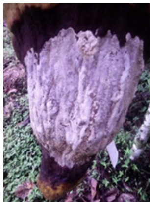
Figure 6: Pod in stain stage after three weeks of sporulation. Granja La Nacional Támara municipality, Colombia SA.